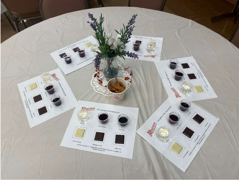
A table set up for tasting of the locally made chocolate.

Photos from the East Row Garden Club February meeting. The invitation promised a perfect treat – chocolate tastings. “Paul and Marlene Picton of Newport own Maverick Chocolate – a family owned and operated bean-to-bar craft chocolate company. They make chocolate the old-fashioned way from ethically sourced cocoa beans to finished chocolate bars, truffles, and drinks.”