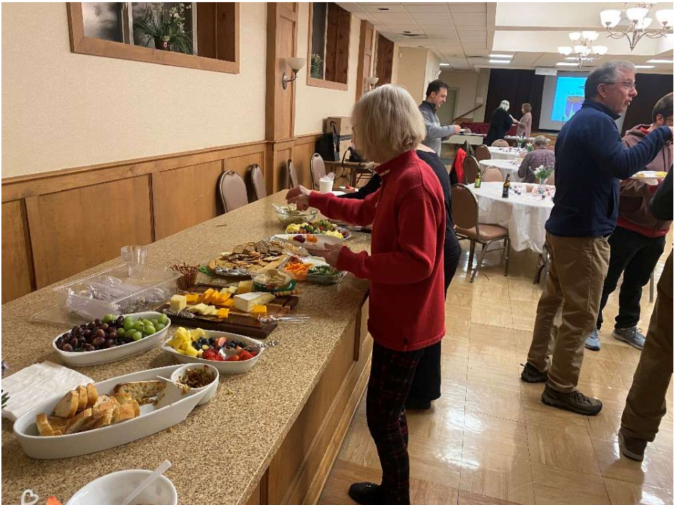
A perfect spread before delightful chocolate tasting dessert.